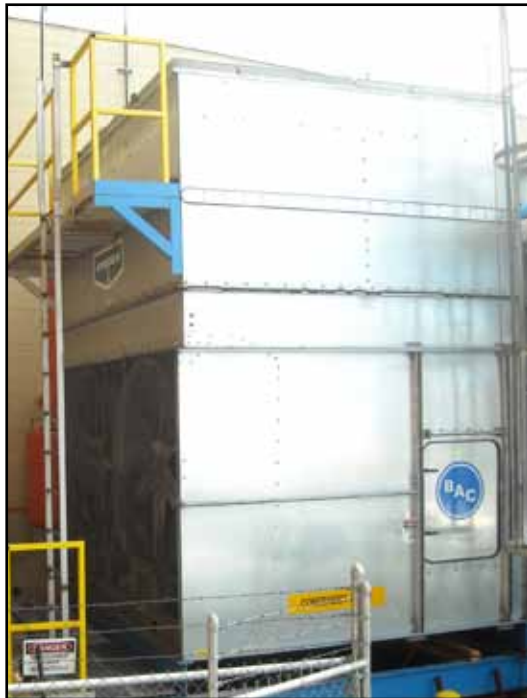
Retrofit Door on Competitor's Unit

Easy access to evaporative cooling equipment has traditionally been a challenge because of the small, round access doors common to most manufacturers' units.